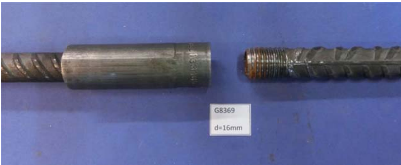
Figure 2: Photo of the shipped couplers, d = 16 \text{ mm}