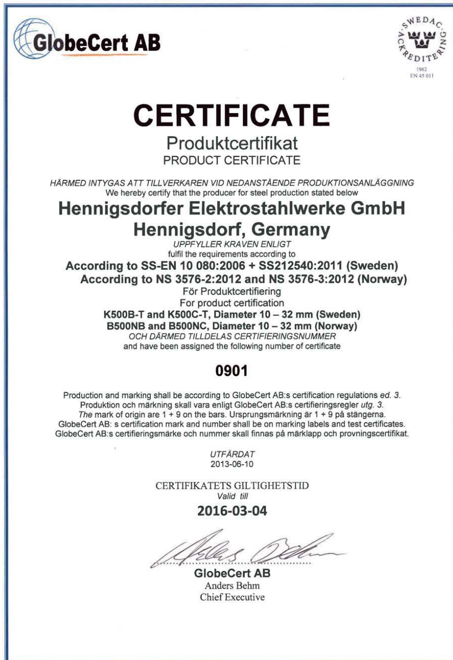
Figure B2: Certificate of Hennigsdorfer Stahlwerke marking 1/9