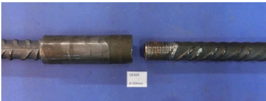
Figure 1: Photo of the shipped couplers, d = 20 mm

The samples are shown in the photo of figure 1 and 2.