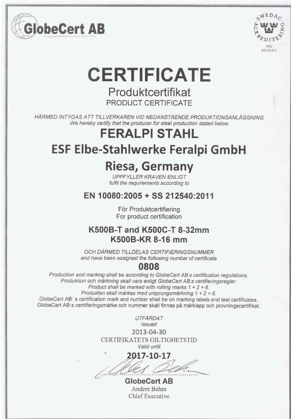
Figure B1: Certificate of Elbe Stahlwerks marking 1/26