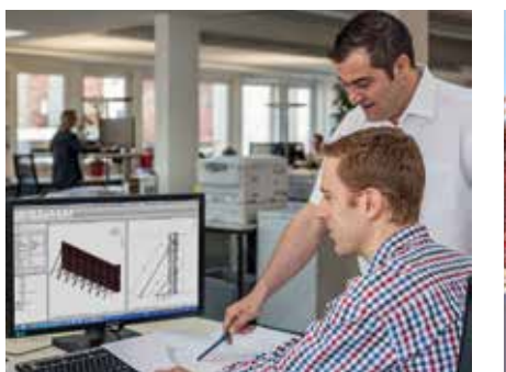
The plug-in Library+ for REVIT connects the PERI component catalogues of the MAXIMO and SKYDECK formwork systems in the Autodesk<sup>®</sup> Revit<sup>®</sup> software for BIM.

such as required plan changes, automated collision checks, safety checklists and QR codes for object navigation, are documented in a mobile building information management system. All relevant data is available on the construction site via tablet solutions for day-to-day operations.