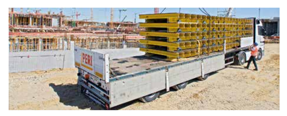
Peak requirements can be covered cost-effectively by renting materials. In addition, renting the appropriate system equipment is the most suitable option for out-of-the-ordinary applications.

Freight management at PERI is geared to meeting the special requirements of construction site logistics. If required, PERI will define the project-specific boundary conditions with customers during the planning phase. Thanks to coordinated freight management operations and targeted coordination of the transport and construction site logistics for formwork and scaffolding materials, construction site processes can be optimised and costs reduced. The use of specialised forwarding agencies and close cooperation over deliveries and collections are key elements here.