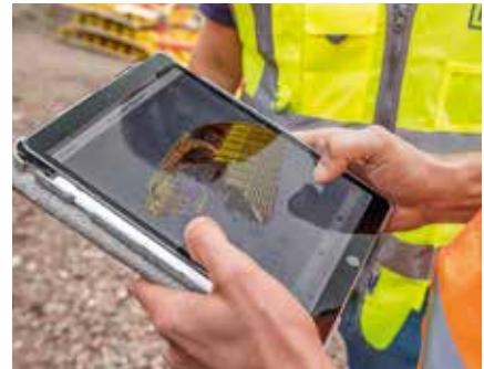
Implementation plans are coordinated, and it becomes much easier and quicker to organise subsequent plan changes and put them into practice.