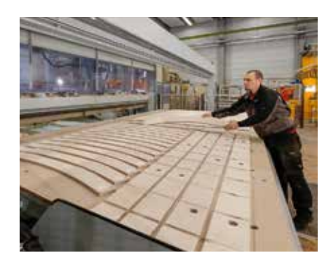
Using state-of-the-art CNC machines, panels are cut ensuring the highest precision and completely in accordance with the specifications of the PERI CAD plan file.

ing a wide range of designs is often requested. PERI offers complete solutions from a single source – from simple CNC cut-to-size panels and box outs through to individual special elements, 3D formwork units and platforms. All elements are customised to match all project requirements in the clearly defined quality and suitable for the planned number of uses.