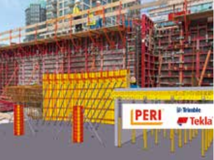
The components of many PERI formwork systems are available in the Tekla Warehouse from Trimble for BIM-related reuse.