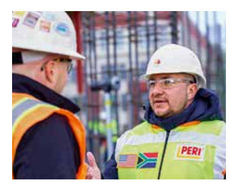
PERI project management also includes the organisation of problem-free return delivery processes.