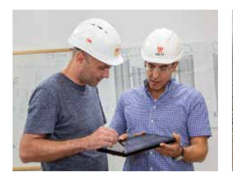
Continuous project support provided by a PERI specialist prevents interface losses and ensures efficient work processes.

have quick access to all important jobsite data. They are the point of contact for all technical, commercial and logistical issues of formwork and scaffolding planning.