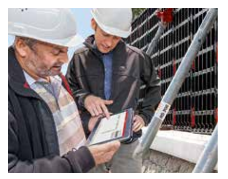
With the DUO Planner, formwork solutions can be quickly planned and without any complex software.

With PERI CAD software, structures can be planned and then graphically visualised thanks to a 3D design.