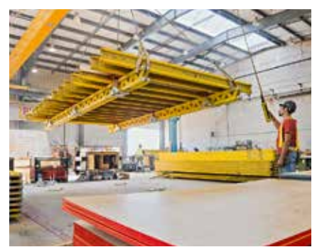
Pre-assembly of girder wall formwork, 3D formwork units or heavy-duty shoring structures can also be carried out by PERI.