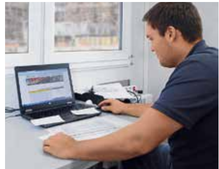
The myPERI online customer portal provides clearly presented reports and makes work processes much easier in many respects.