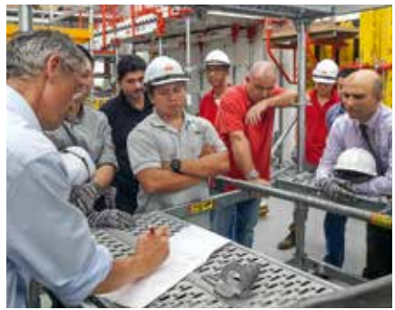
Training and courses are tailored to meet individual requirements and are offered worldwide.