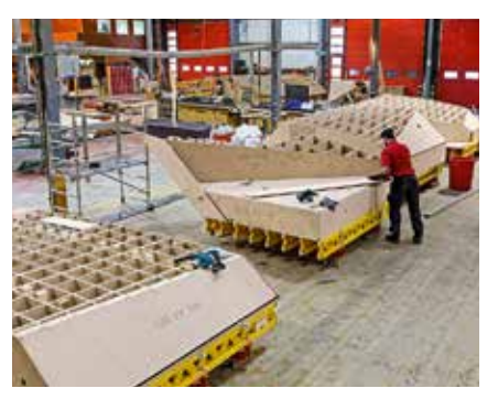
PERI provides customised 3D boxed elements for the construction of complex, multi-curved reinforced concrete components.