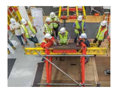
Practical sessions provide the ideal opportunity to become familiar with the assembly process.