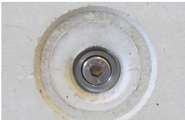
Photo 2 Screw plugs "Schraubstopfen MX 15-75 OF-L" and "Schraubstopfen MX 15-75 OF-S" Unexposed face before fire test