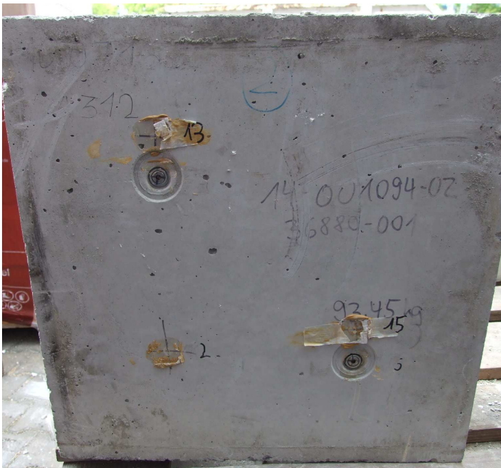
Photo 5 Unexposed face after fire test