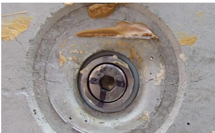
Photo 6 Screw plugs "Schraubstopfen MX 15-75 OF-L" and "Schraubstopfen MX 15-75 OF-S" Unexposed face after fire test