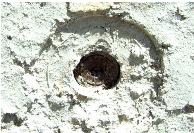
Photo 8 Screw plugs "Schraubstopfen MX 15-75 OF-L" and "Schraubstopfen MX 15-75 OF-S" Exposed face after fire test