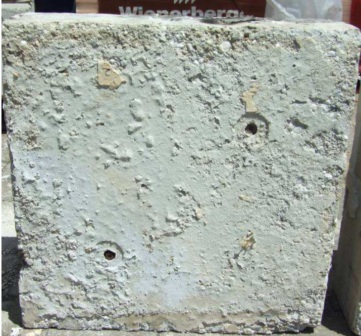
Photo 7 Exposed face after fire test