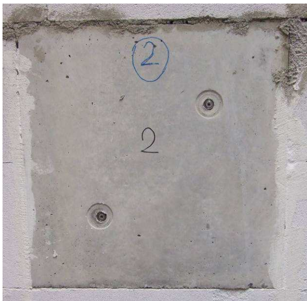
Photo 3 Exposed face before fire test