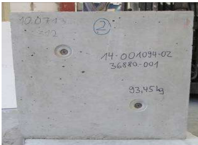
Photo 1 Unexposed face before fire test