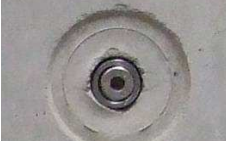
Photo 4 Screw plugs "Schraubstopfen MX 15-75 OF-L" and "Schraubstopfen MX 15-75 OF-S" Exposed face before fire test