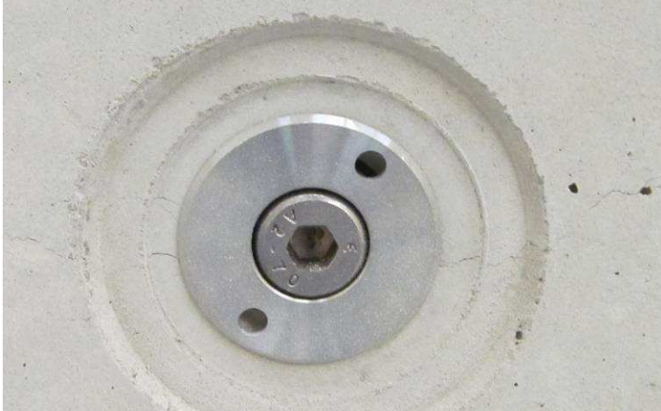
Photo 4 Screw plugs "Schraubstopfen MX 15-75 MF-L" and "Schraubstopfen MX 15-75 MF-S" Exposed face before fire test