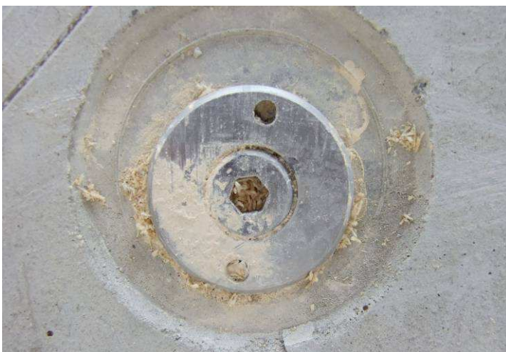
Photo 6 Screw plugs "Schraubstopfen MX 15-75 MF-L" and "Schraubstopfen MX 15-75 MF-S" Unexposed face after fire test