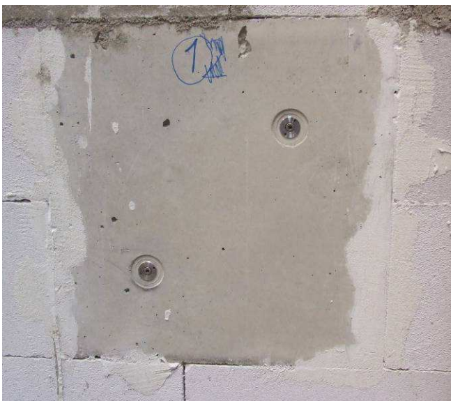
Photo 3 Exposed face before fire test