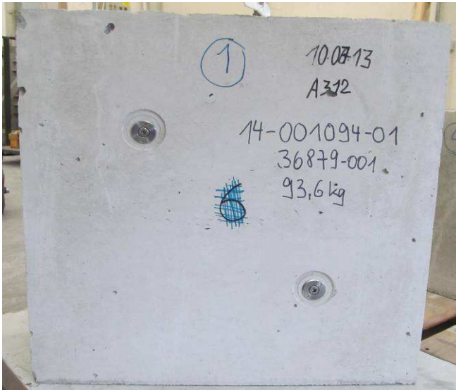
Photo 1 Unexposed face before fire test