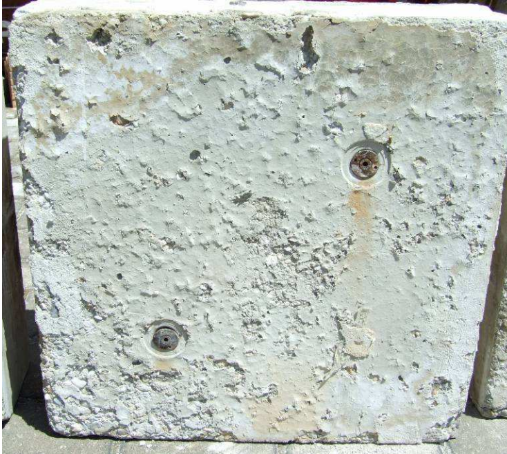
Photo 7 Exposed face after fire test