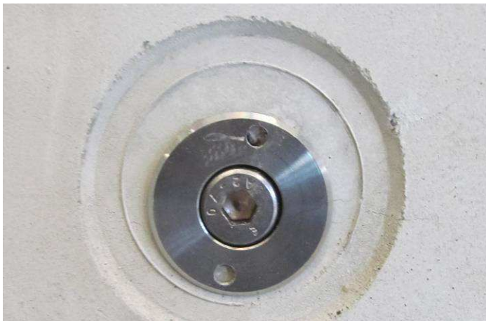
Photo 2 Screw plugs "Schraubstopfen MX 15-75 MF-L" and "Schraubstopfen MX 15-75 MF-S" Unexposed face before fire test