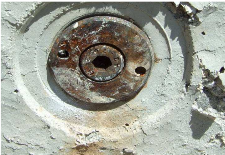
Photo 8 Screw plugs "Schraubstopfen MX 15-75 MF-L" and "Schraubstopfen MX 15-75 MF-S" Exposed face after fire test